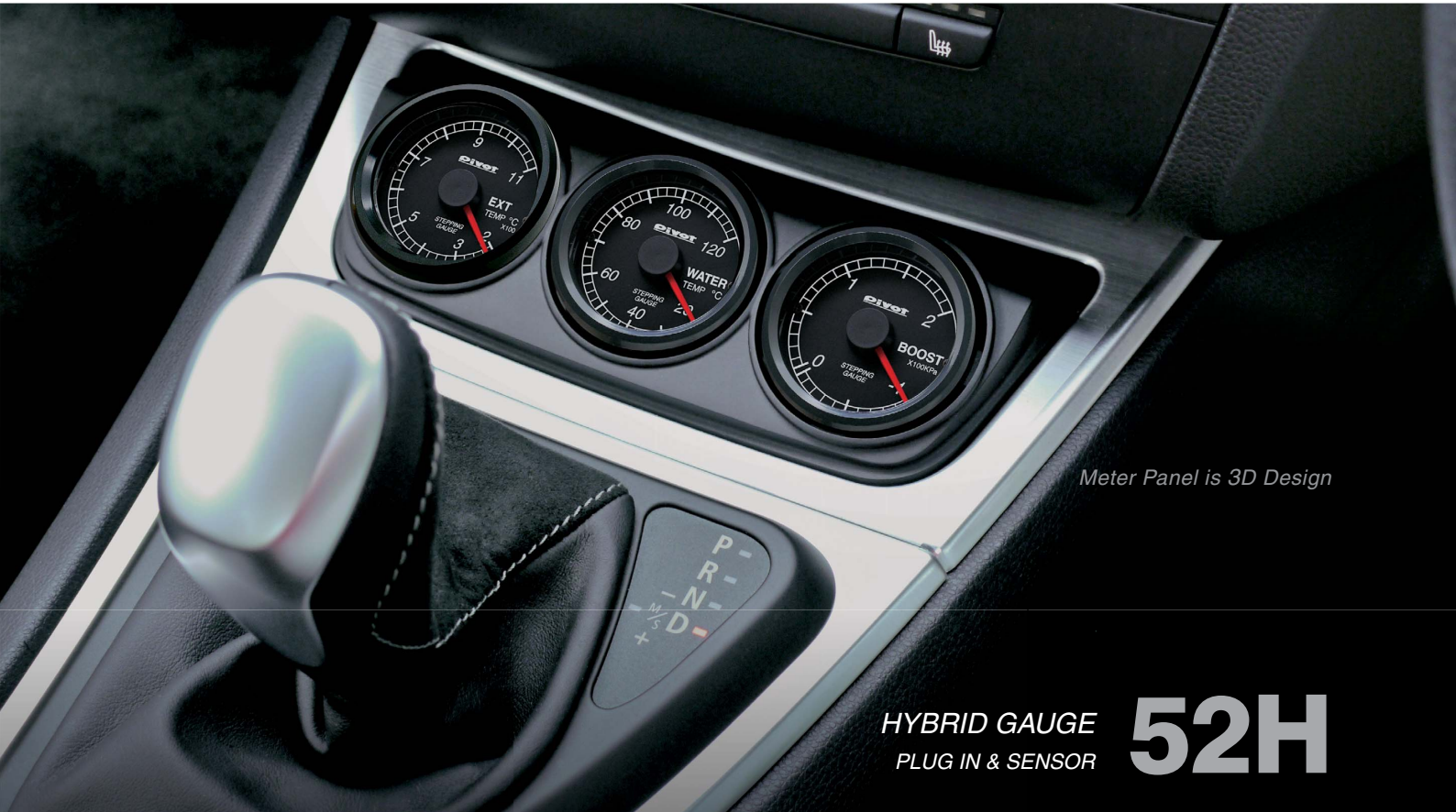
Meter Panel is 3D Design