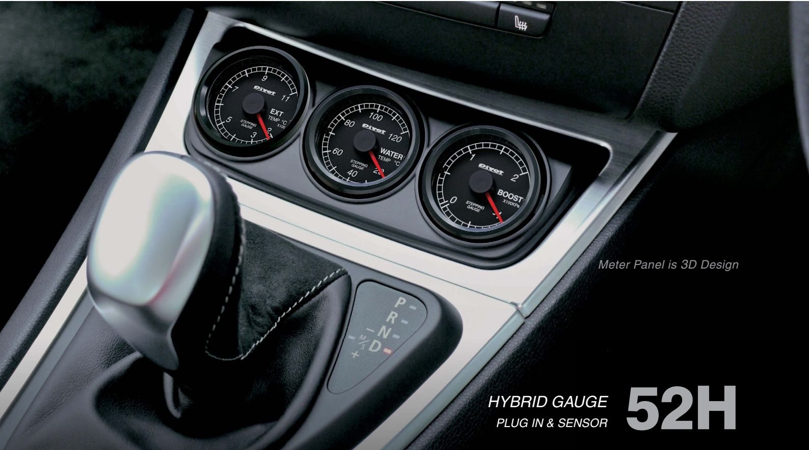
Meter Panel is 3D Design