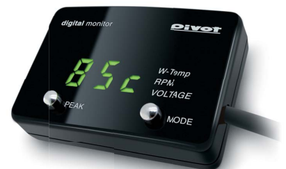
DMC-G (Display color: Green) ¥12,000