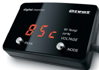
DMC (Display color: Red) ¥12,000