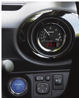
for HYBRID Cars

AQUA (NHP10) PRIUS (ZVW30) PRIUS α (ZVW40) COROLLA AXIO (NKE165) FIT HYBRID (GP5)