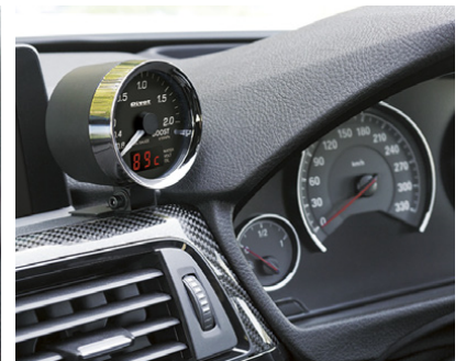
for BMW / MINI / VW / AUDI

116i (F20) 420i (F32/36) MINI COOPER S (R56) 120i (F20) 523i (F10/11) GOLF7 (TSI) M135i (F20) Z4 20i (E89) POLO (6R) M235i (F22) X1 20i (E84) THE BEETLE 320i (F30/31) TT (8J)