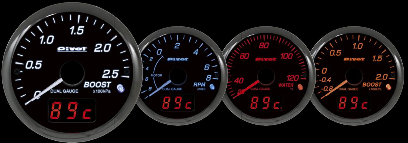
for MAZDA SKYACTIV-D