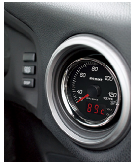
for 86 / BRZ

AQUA (NHP10) PRIUS (ZVW30) PRIUS α (ZVW40) COROLLA AXIO (NKE165) FIT HYBRID (GP5)