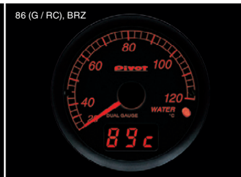
White Illumination DXW-W