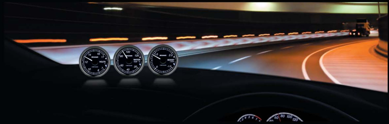
CYBER GAUGE OBD or SENSOR SYSTEM